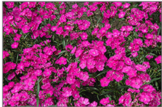
Bouquet Purple Pinks in bloom