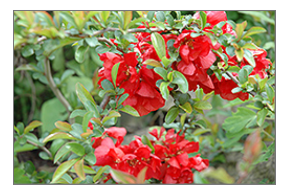
Texas Scarlet Flowering Quince flowers