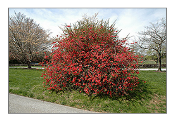
Texas Scarlet Flowering Quince in bloom

This is a high maintenance shrub that will require regular care and upkeep, and should only be pruned after flowering to avoid removing any of the current season's flowers. Gardeners should be aware of the following characteristic(s) that may warrant special consideration;