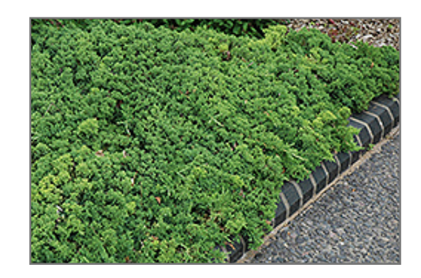
Green Mound Dwarf Japanese Juniper

This is a relatively low maintenance shrub, and is best pruned in late winter once the threat of extreme cold has passed. Deer don't particularly care for this plant and will usually leave it alone in favor of tastier treats. It has no significant negative characteristics.