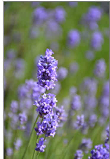
Hidcote Blue Lavender flowers