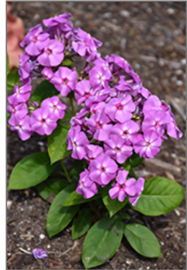
Lilac Flame Garden Phlox in bloom

Lilac Flame Garden Phlox is recommended for the following landscape applications;