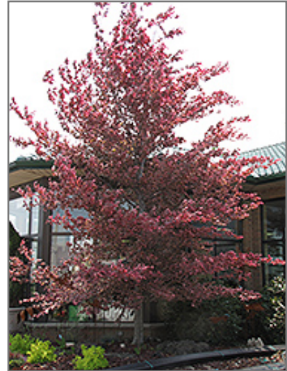
Tricolor Beech