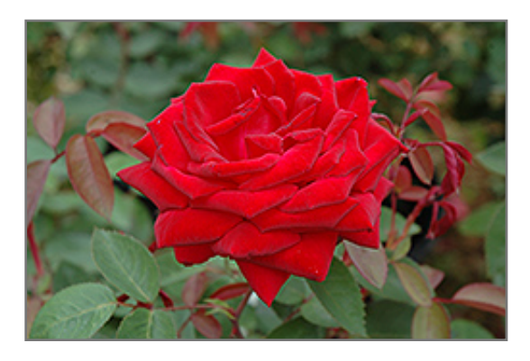
Kashmir Rose flowers

Kashmir Rose is recommended for the following landscape applications;