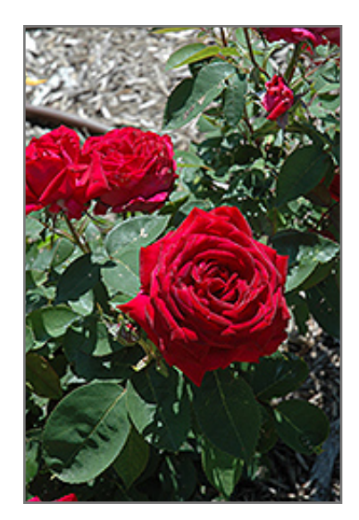
Kashmir Rose flowers