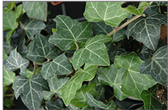
Baltic Ivy foliage