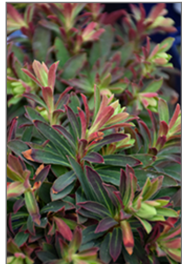
Tiny Tim Spurge flowers