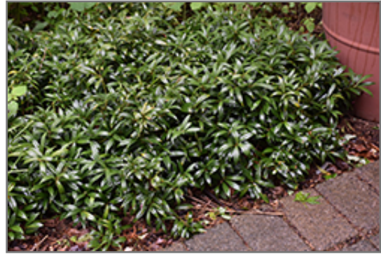
Himalayan Sweet Box

Himalayan Sweet Box is recommended for the following landscape applications;