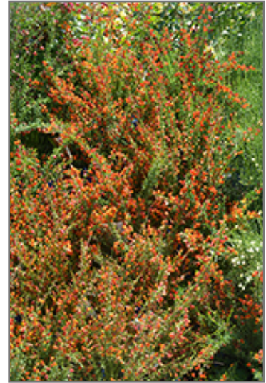
Lena Scotch Broom in bloom

This shrub should only be grown in full sunlight. It prefers dry to average moisture levels with very well-drained soil, and will often die in standing water. It is considered to be drought-tolerant, and thus makes an ideal choice for xeriscaping or the moisture-conserving landscape. It is particular about its soil conditions, with a strong preference for clay, alkaline soils, and is able to handle environmental salt. It is highly tolerant of urban pollution and will even thrive in inner city environments. This particular variety is an interspecific hybrid.