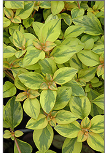
Walkabout Sunset Loosestrife foliage

Walkabout Sunset Loosestrife is recommended for the following landscape applications;