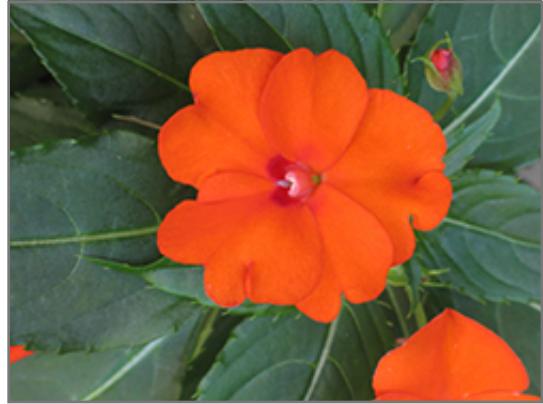
Infinity Orange New Guinea Impatiens flowers

Infinity Orange New Guinea Impatiens is recommended for the following landscape applications;