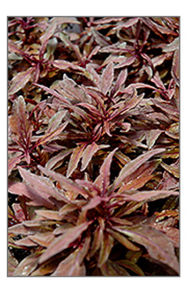
ColorBlaze Velvet Mocha Coleus foliage

ColorBlaze Velvet Mocha Coleus will grow to be about 3 feet tall at maturity, with a spread of 24 inches. When grown in masses or used as a bedding plant, individual plants should be spaced approximately 20 inches apart. Although it's not a true annual, this fast-growing plant can be expected to behave as an annual in our climate if left outdoors over the winter, usually needing replacement the following year. As such, gardeners should take into consideration that it will perform differently than it would in its native habitat.