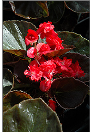
Doublet Red Begonia flowers