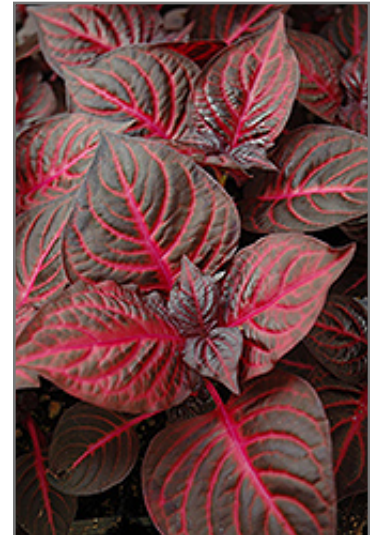
Blazin' Rose Blood Leaf foliage