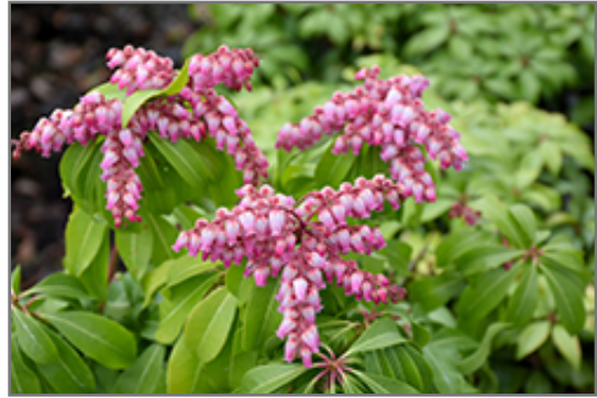
Shojo Japanese Pieris flowers

Shojo Japanese Pieris is recommended for the following landscape applications;