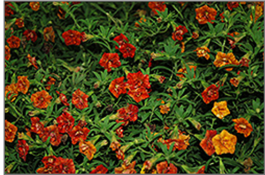
Superbells Double Salsa Calibrachoa flowers

Superbells Double Salsa Calibrachoa is recommended for the following landscape applications;