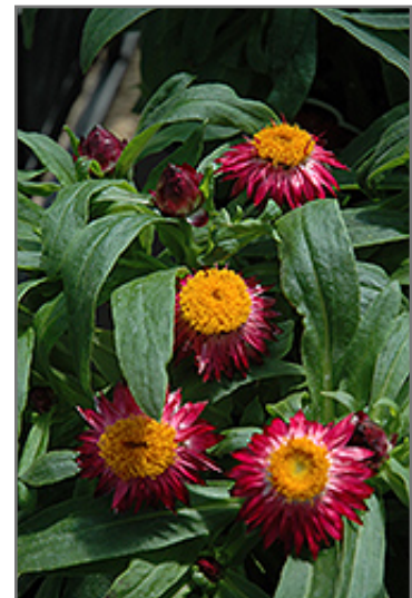
Mohave Dark Red Strawflower flowers