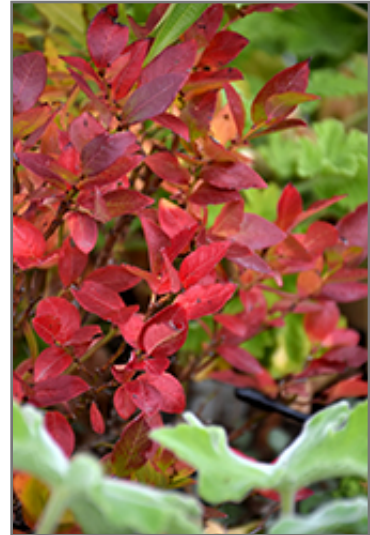
Jelly Bean Blueberry in fall

Jelly Bean Blueberry features dainty clusters of white bell-shaped flowers with shell pink overtones hanging below the branches in mid spring. It has red-variegated green foliage. The glossy oval leaves turn an outstanding red in the fall. It features an abundance of magnificent blue berries in mid summer.