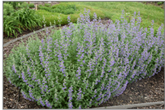
Walker's Low Catmint in bloom