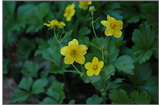
Barren Strawberry flowers