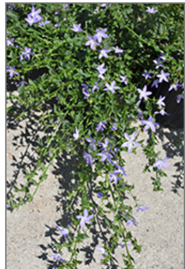
Blue Waterfall Serbian Bellflower in bloom