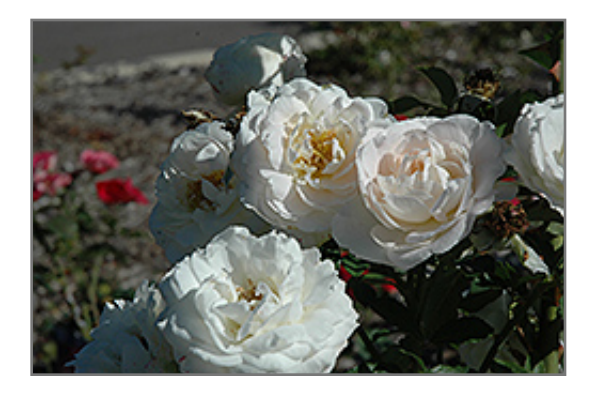
Snowdrift Rose flowers