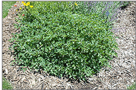
Japanese Bottlebrush