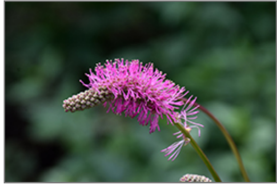
Japanese Bottlebrush flowers

Japanese Bottlebrush is recommended for the following landscape applications;