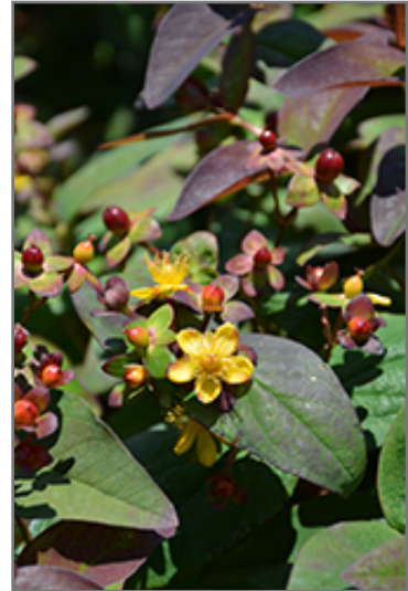
Albury Purple St. John's Wort flowers