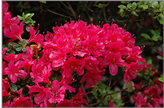
Hino Crimson Azalea flowers

This shrub does best in full sun to partial shade. You may want to keep it away from hot, dry locations that receive direct afternoon sun or which get reflected sunlight, such as against the south side of a white wall. It requires an evenly moist well-drained soil for optimal growth, but will die in standing water. It is very fussy about its soil conditions and must have rich, acidic soils to ensure success, and is subject to chlorosis (yellowing) of the foliage in alkaline soils. It is somewhat tolerant of urban pollution, and will benefit from being planted in a relatively sheltered location. Consider applying a thick mulch around the root zone in winter to protect it in exposed locations or colder microclimates. This particular variety is an interspecific hybrid.