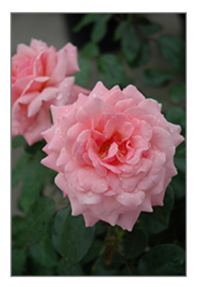
Sexy Rexy Rose flowers